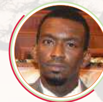
NAÏR ABAKAR Ambassadeur République du Tchad